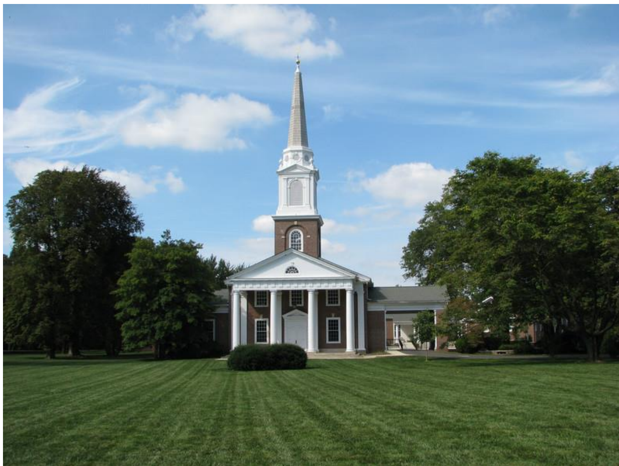
First Presbyterian Church – Moorestown Mission Study Report Prepared 11/22/2016