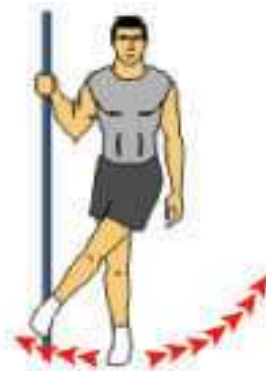
Leg Swings side to side 10-15 times each leg