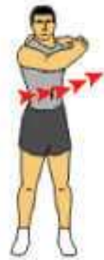
Shoulder Twists - 10-15 reps on each side