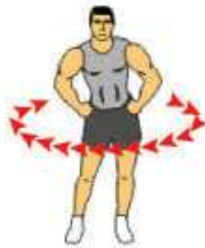
Hip Rotations 10-15 in each direction