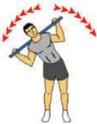
Side Bends - 10 on each side