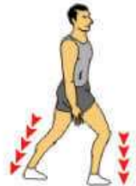
Lunges - 8-10 on each leg