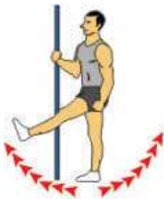
Leg Swings front and back 10-15 times each leg