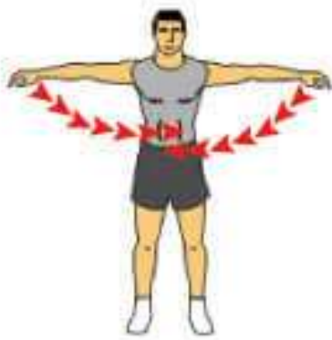
Arms across chest 15-20 reps