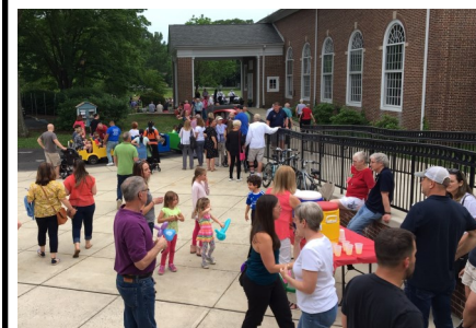
What a beautiful summer evening