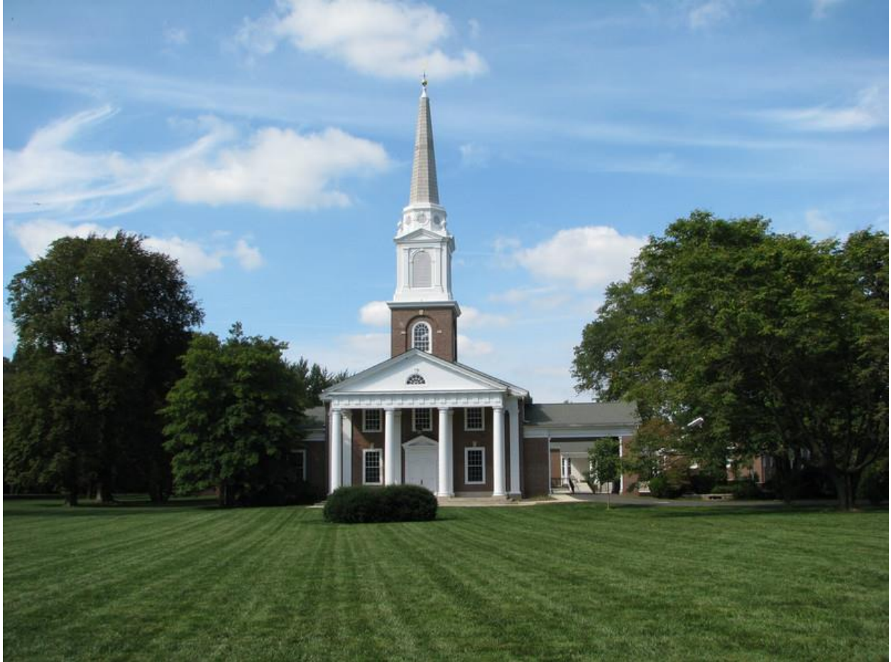
First Presbyterian Church – Moorestown Mission Study Report Prepared 11/22/2016