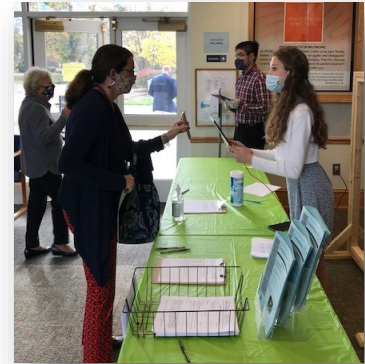
Checking in for worship

Check-in quickly, easily and contact-free from your smart phone. See the volunteer upon arriving. Download the “Church Center App” from either the App Store (iPhone) or Google Play (Android). Follow prompts to enter our church, and select Check In when you arrive. Hit NEXT to obtain the QR code and scan when attending worship to register your attendance. See our website.