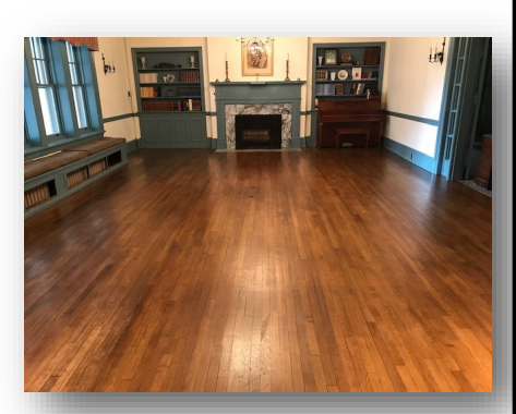
Newly refurbished hardwood floors in the Lounge are sparkling