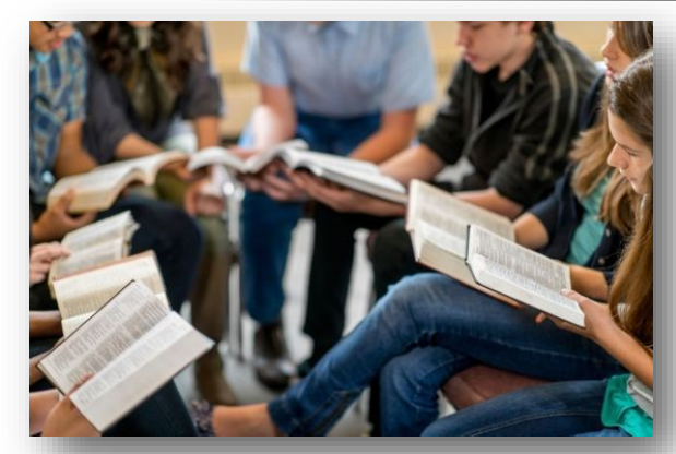
Find relationships in a youth small group

Kingdom Kids: Grades K-3 Wednesdays 4:45-5:45 pm Crossing Zone: Grades 4-6 Wednesdays 6:30-7:30 pm Flock: Grades 7-8 Wednesdays 6:30-8 pm Wave: Grades 9-12 Sundays 6:30-8:30 pm