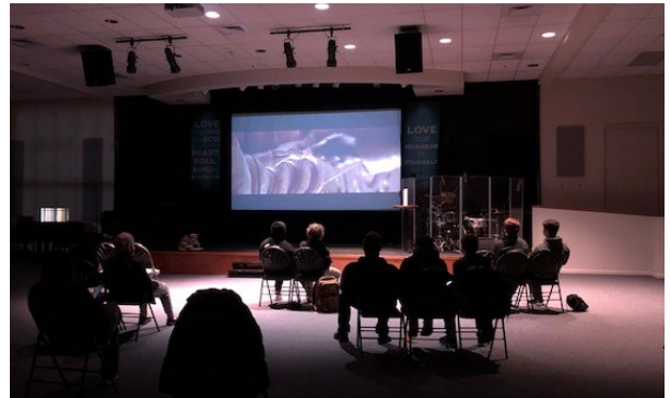
Youth enjoying a safely spaced Movie Night in Miller Commons January 30th

The Lent bags will also include the One Great Hour of Sharing "fish banks," our traditional Palm Sunday activity.