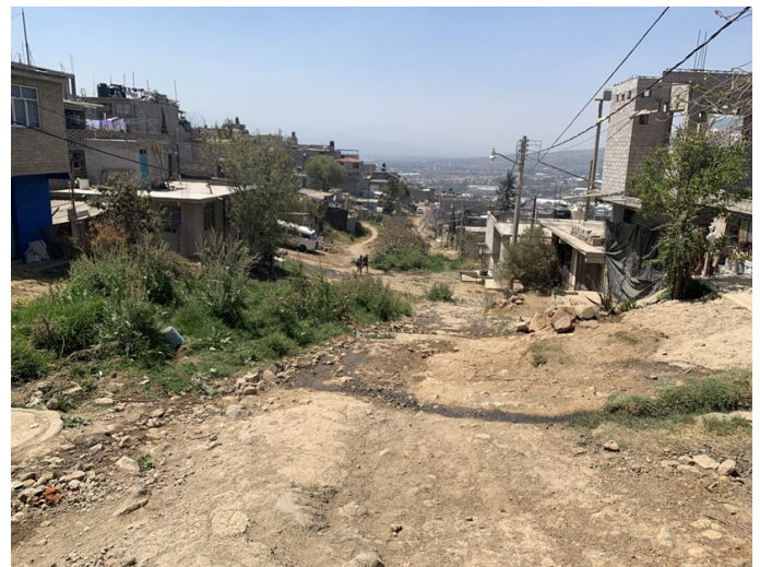
Arrival to San Isidro Community Center.

I arrive at the San Isidro Community Center- a place where SHALOM is being tested. As I park, my first thought is: "Do I have a flat tire?" So many bumpy, unpaved roads...I unload my gear and head inside to find a group of youth meeting for their Casa de Paz (Shalom Group).