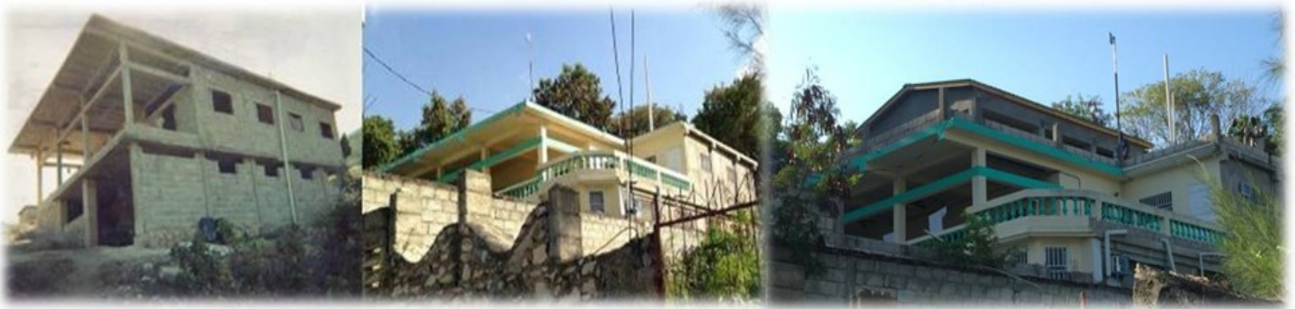
Our main facility in Mariani, through the years.

In 1982, when God broke our hearts to help the Haitian people, we had to step out in Faith. We knew nothing about the country, its people or how we would accomplish His call to help. We prayed earnestly, and worked with other Haitian missions; but God kept nudging us to step out in Faith again. We purchased land and built our first medical clinic. In the years that followed, we established four more medical facilities in the country, a nutrition hospital, and more - all from that first step!