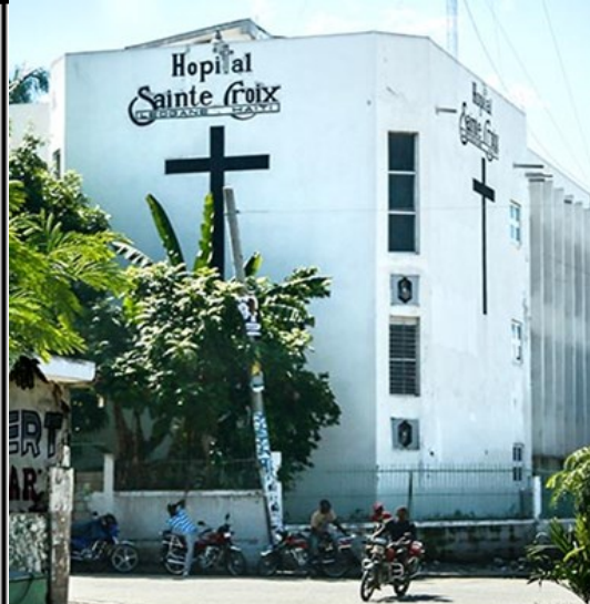
HOLY CROSS HOSPITAL