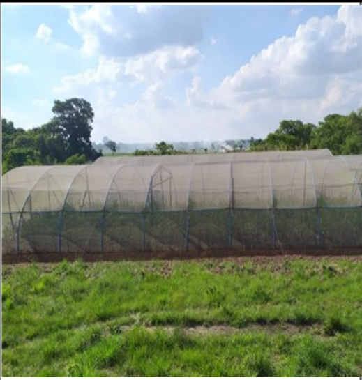
SEEDS OF PROMISE