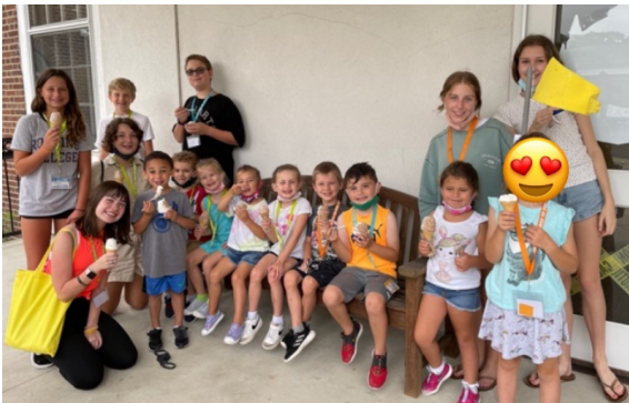
Our spirit-filled week was capped off with a cold treat from Mister Softee on Friday!