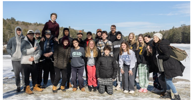
WHAT A WEEKEND! Our high schoolers enjoyed an incredible Winter Retreat at Lake Champion (NY)

Kingdom Kids: Grades K-3 Wednesdays 4:45-5:45 pm Crossing Zone: Grades 4-6 Wednesdays 6:30-7:30 pm Middle School: Grades 7-8 Wednesdays 6:30-8:00 pm High School: Grades 9-12 Sundays 6:30-8:30 pm