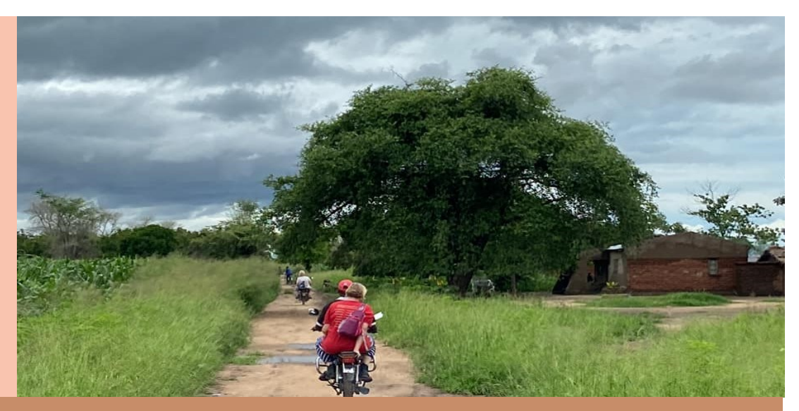
A NEWSLETTER FROM THE MISSION COMMITTEE OF FPC MOORESTOWN

In this issue>>> Mission May Malawi Malawi Missionwares Help fill the Bins Beat the Rain Game Meet Malawi Fellows Malawi Videos Meet the Fellows