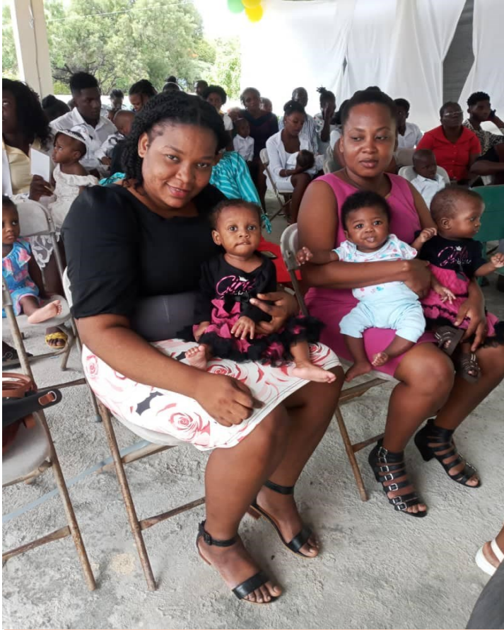
Above: In June, Hope Alive Clinic celebrated 24 years in ministry serving families and malnourished babies.

Despite the civil unrest in Haiti, our mission partners continue to serve their communities.