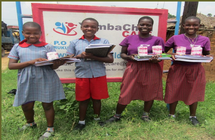
Above: Yamba Child Care in Uganda equipped 105 students with school supplies and uniforms.