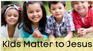
Kids Matter to Jesus

There will be NO Kingdom Kids, Crossing Zone or Family Dinner on Ash Wednesday February 22 so that children may worship with their family. Worship is at 7:00 pm. We will see you on Wednesday, March 1!