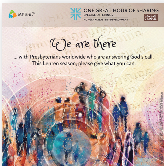
One Great Hour of Sharing — April 2 Palm Sunday