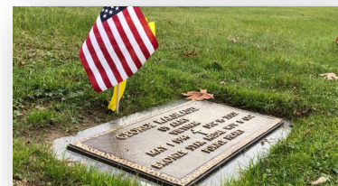
Veterans Day November 11, 2023