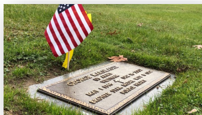
Veterans Day November 11, 2023

Included in worship bulletins on Sunday, Nov. 19 will be our traditional Thanksgiving postcards. Fill in the name and address of someone you are grateful for and wish to tell, and mail from your home, or place addressed postcards in the offering plate for the church to mail. Postcards given to the church office will be mailed on Monday, Nov. 20 so they arrive in time for Thanksgiving.