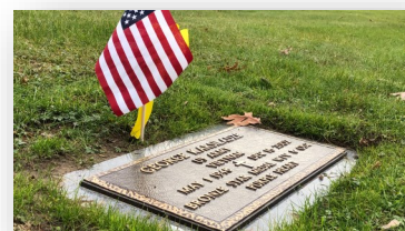
Veterans Day November 11, 2023