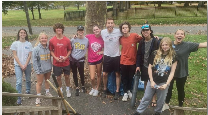
We Love Youth Group!