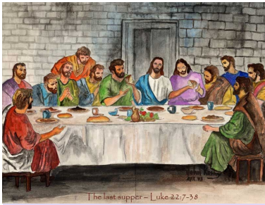
The last supper - Luke 22:7-38