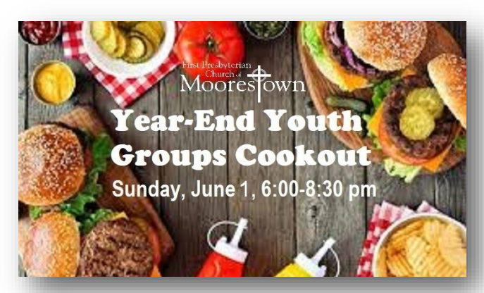
See below for last regular meeting dates

Kingdom Kids: Grades K-3 Wednesdays 4:45-5:45 pm Crossing Zone: Grades 4-6 Wednesdays 6:30-7:30 pm Middle School: Grades 7-8 Wednesdays 6:30-8:00 pm High School: Grades 9-12 Sundays 6:30-8:30 pm