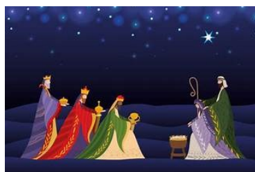
Epiphany January 6, 2026

Per our Bylaws, copies of the 2025 Annual Report will be available Sunday, January 25, 2026 online and in limited hard copies at the church.